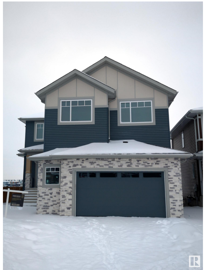
91 Edgefield Wy, St. Albert, AB

2 Storey 2,848 +/- SF on a Walk-Out lot onto the Pond. Fully fenced and Landscaped Plus 1,193 +/- SF Bsmt developed. TOTAL 4,041 +/- SF developed. Designed for family enjoyment plus large gatherings! Enjoy tranquility watching the Sunset over the pond. Covered deck off Dining Room, Primary Suite and at ground level patio. Huge Spa style Ensuite - separate water closet. Double vanity. Invigorate in the spa shower or relax in the huge soaker tub. 3 additional Bedrooms on the same floor all with 4 Pce Bathrooms. Plus, main floor den/bedroom with adjacent full bath. 5th Large Bsmt. Bdrm. Large Kitchen Plus a full 2nd Kitchen. Entertain guests in the Living Room while others relax in the Bonus Room overlooking the Great Room or bsmt family room c/w wet bar w bar stool height island or enjoy the games room. Open design allows flow of natural light thru-out. Store your toys™ in the oversized garage. Access to the Park/Pond/Pathways. Major Shopping, Schools, Recreation Facilities, Major/Minor Arterial Roads