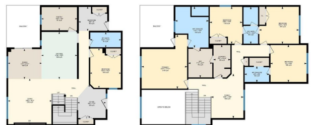
Main Floor Exterior Area 1281.25 sq ft

Main Building - Total Exterior Area Above Grade 2348.01 sq ft